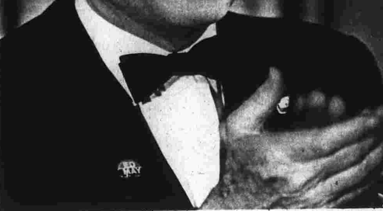
CANDIDATE AT HARTFORD

These are perhaps justified views to offer concerning developments which have apparently brought considerable satisfaction and cheer to the two national leaderships involved, that of President Johnson in Moscow.